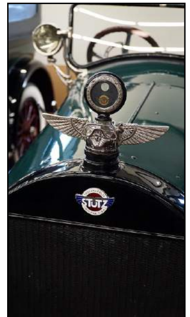
Kirk Prentiss Photos