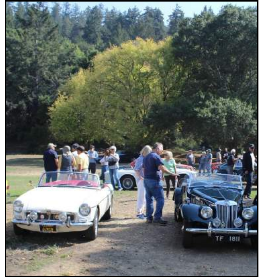
Brit Meet at Roaring Camp