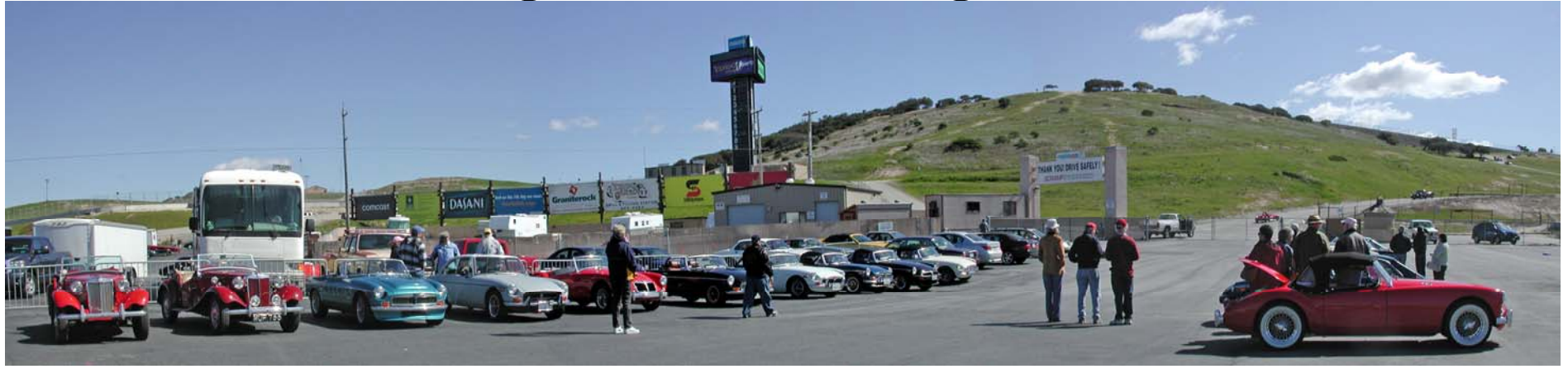
Rows of MGs in the paddock (above)