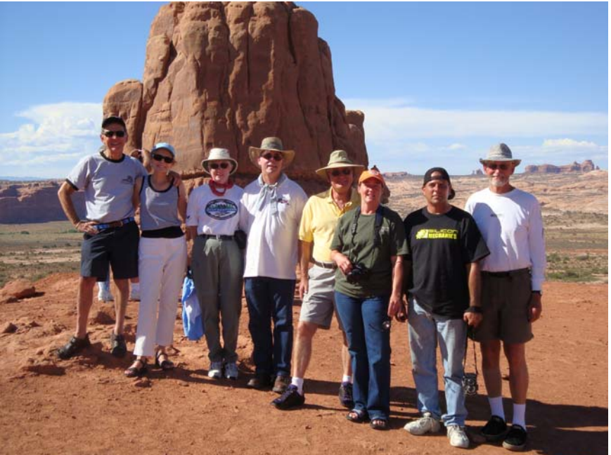
At Arches National Park