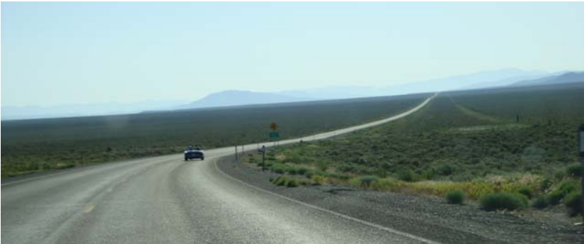
The loneliest road in America (above), the car show at Breckenridge (below)