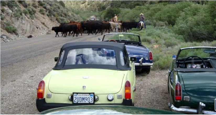
Waiting for a cattle drive in Nevada